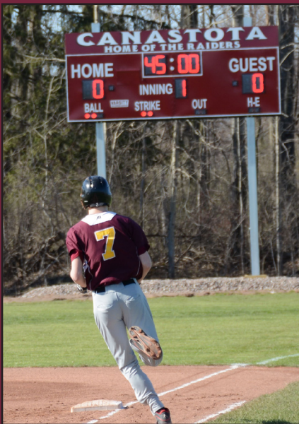
Digital score board in action at a Varsity Baseball game against Madison in April.